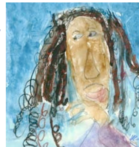
FIP IG SE Activity 2