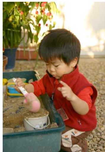
FIP IG Math Activity 8