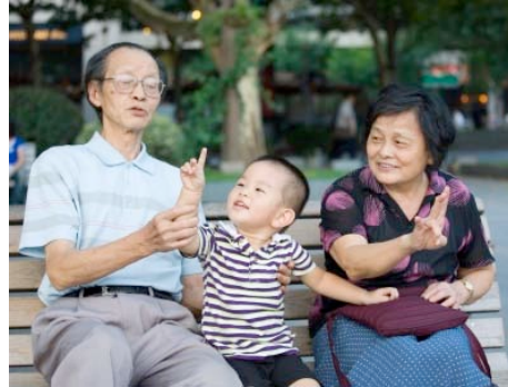
FIP IG Math Activity 7