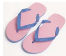
FIP IG Math Activity 7