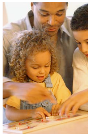
FIP IG Math Activity 4