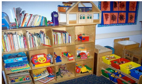
FIP IG Math Activity 12