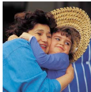
FIP IG LL Activity 8