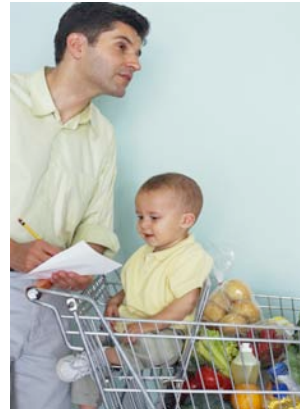
FIP IG LL Activity 7