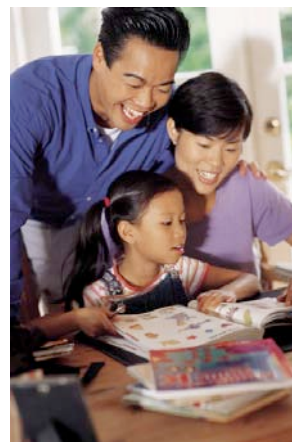
FIP IG LL Activity 6