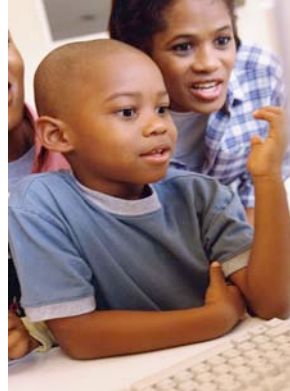
FIP IG LL Activity 6

How might these changes have influenced the literacy activities or experiences that families provide for their young children?