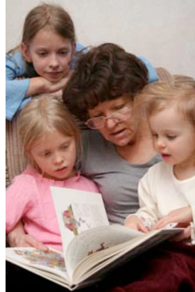
FIP IG LL Activity 11