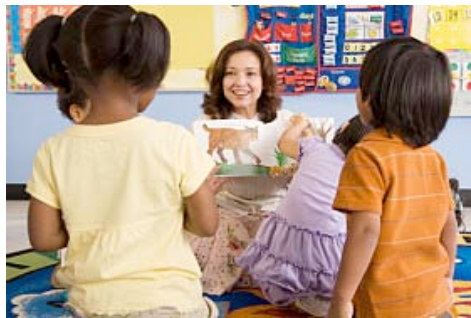
FIP IG LL Activity 11