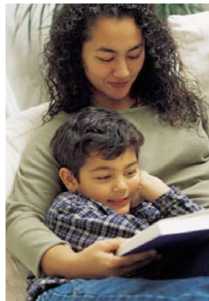
FIP IG ELD Activity 9

ELD: Reading ELD: Writing L&L: Reading L&L: Writing